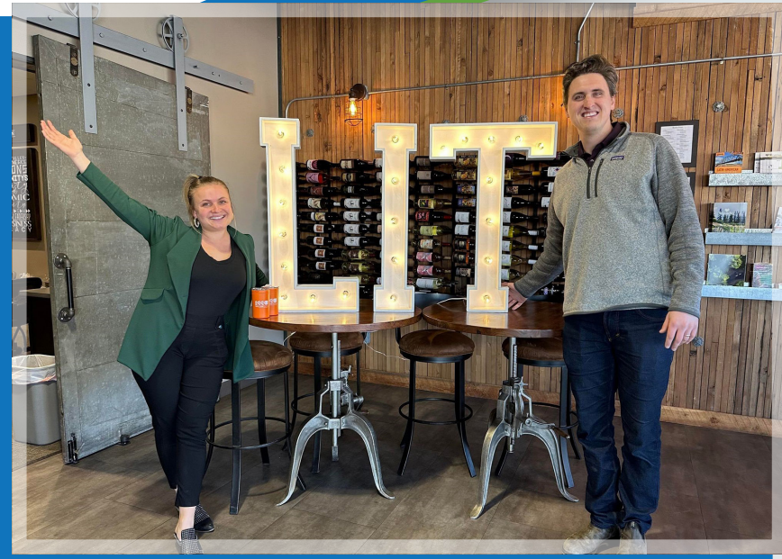
We are currently one of only two communities in the state of Washington that offer this resource.