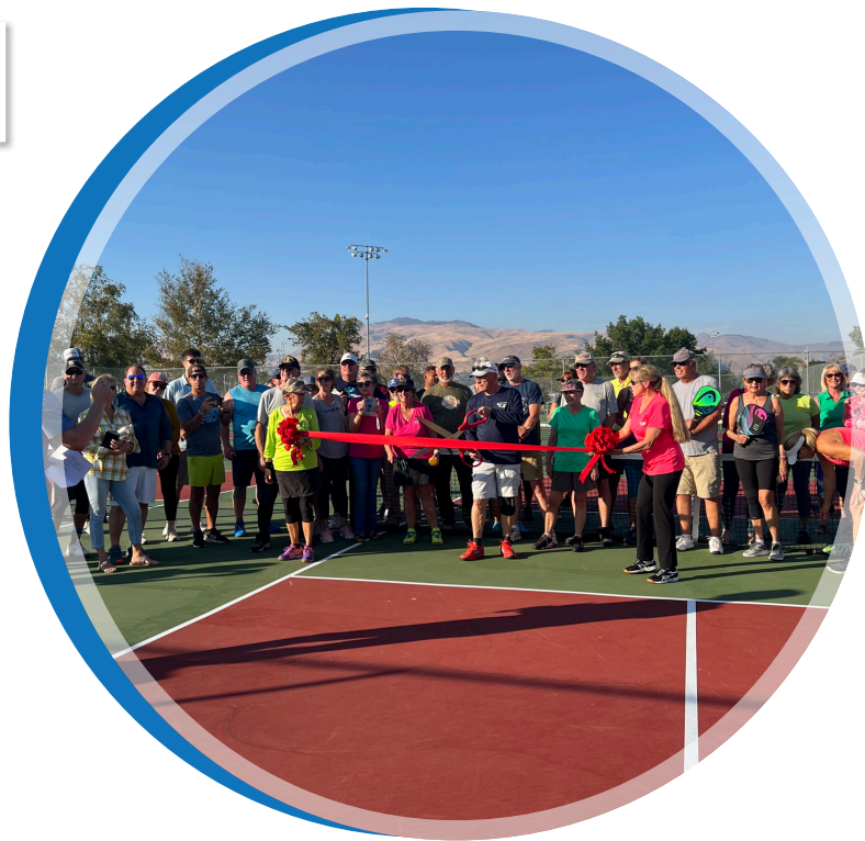
Thanks to investments from Chelan County PUD and the Wenatchee Valley Pickleball Club this fall we had the unique opportunity to celebrate brand new Pickleball Courts at Walla Walla Point Park with a ribbon cutting attended by over 50 enthusiastic fans.

We love celebrating our members! Ribbon cutting ceremonies celebrate a new business member's grand opening, or the expansion or new ownership of an existing business member in our community.