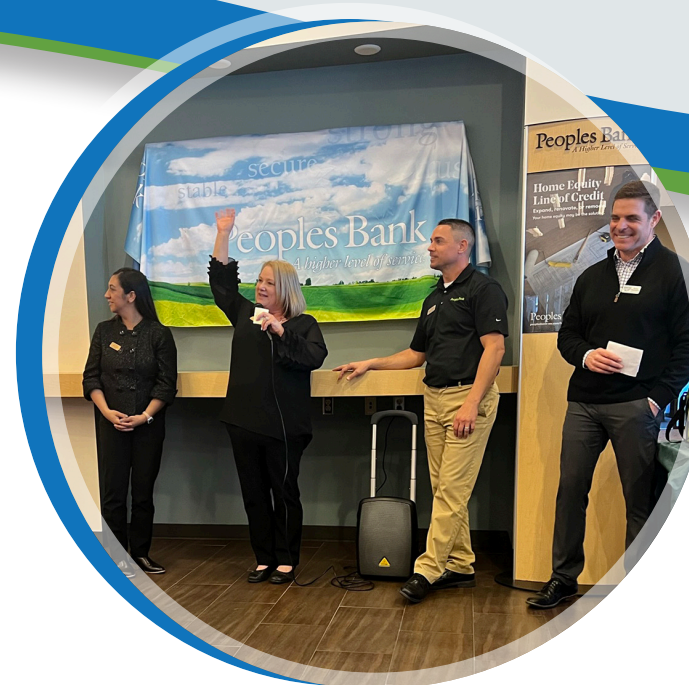
Thanks to host business, People's Bank, and their amazing staff, in May we held a well-attended Business After Hours where attendees enjoyed delicious food catered by Blue Skies Food Shack, featured wine from Virginia Thomas Winery, and generous raffle prizes.

Each month we collaborate with the Wenatchee Downtown Association and Small Business Development Center to host Wenatchee Valley's 1 Million Cups conversations; bringing together entrepreneurs in our community to discover how we can support them, empower them, and connect them to vital resources.